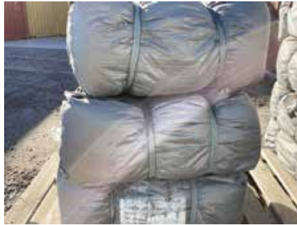
5m x 100m Diamond 500 Bale