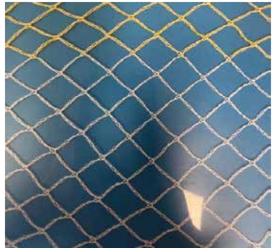
MUIR SUPER PREMIUM GOLD Quality construction Outstanding durability Preferred netting brand Strongest Diamond Netting

ORDER QTY: Minimum customisable order qty is 20 bales