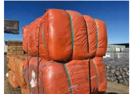
15m x 300m HEX Bale