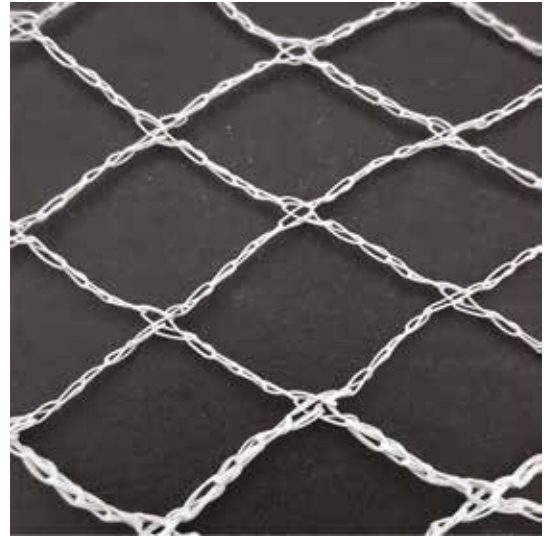
DIAMOND 500 Entry level bird netting Lowest Cost

ORDER QTY: Minimum customisable order qty is 20 bales