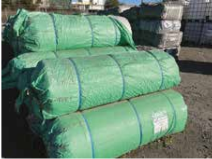
Throw Over – Bird Netting Bale

*Special order widths are possible if they meet the minimum production run of 20 bales