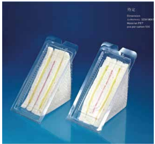
SANDWICH PACK MATERIAL: PET Food Grade