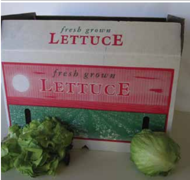
WAXED LETTUCE CARTON SUIT :- Field packed Lettuce Sizes :- 62D – 560mm x 365mm x 305mm 75D - 565mm x 350mm x 280mm 82D - 564mm x 370mm x 290mm 83D - 560mm x 365mm x 335mm