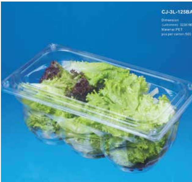
SALADS CONTAINER CJ-3L-125- Base MATERIAL: PET Food Grade. DIMENSIONS. (L x W x H ): 323 x 190 x 130