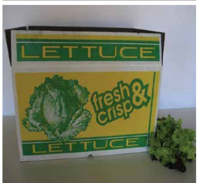
WAXED LETTUCE CARTON SUIT :- Field packed Lettuce Sizes :- 62D – 560mm x 365mm x 305mm 75D - 565mm x 350mm x 280mm 82D - 564mm x 370mm x 290mm 83D - 560mm x 365mm x 335mm