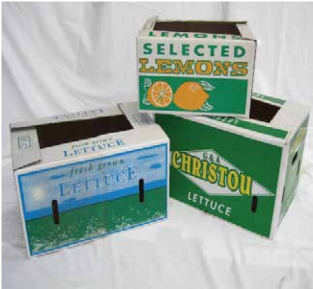
ASSORTED WAXED FRESH PRODUCE CARTONS. SUIT:- Carrots, Leeks, Celery, Parsnips, Herbs, Seedlings, Spinach/Kale, Fennel