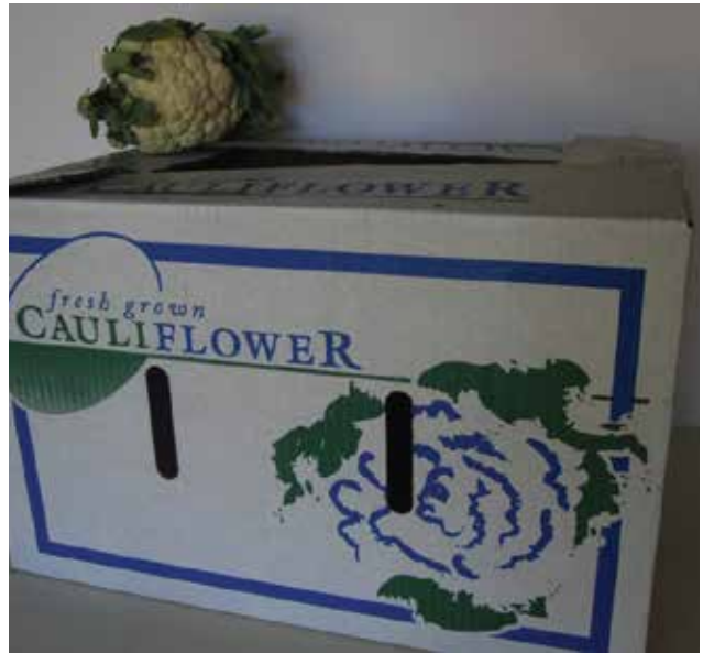
WAXED CAULIFLOWER CARTON SUIT :- Field packed Cauliflowers Sizes :- CF34D – 579mm x 370mm x 338mm - 6 Layer CFO3D – 570mm x 370mm x 350mm - 6 Layer