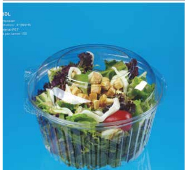
SALADS BOWL 48DL MATERIAL: PET Food Grade DIMENSIONS. L x W x H ): Dia. 176 x 115