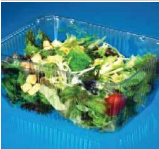
SALADS CONTAINER OP 7 X 5 X 3.25 Material: PET Food Grade DIMENSIONS. (L x W x H ): 179 x 140 x 84